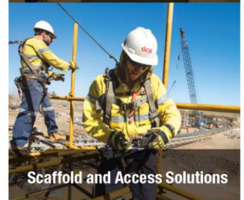
Scaffold and Access Solutions