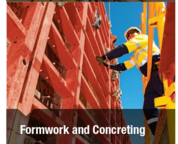
Formwork and Concreting