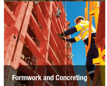
Formwork and Concreting