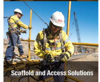
Scaffold and Access Solutions